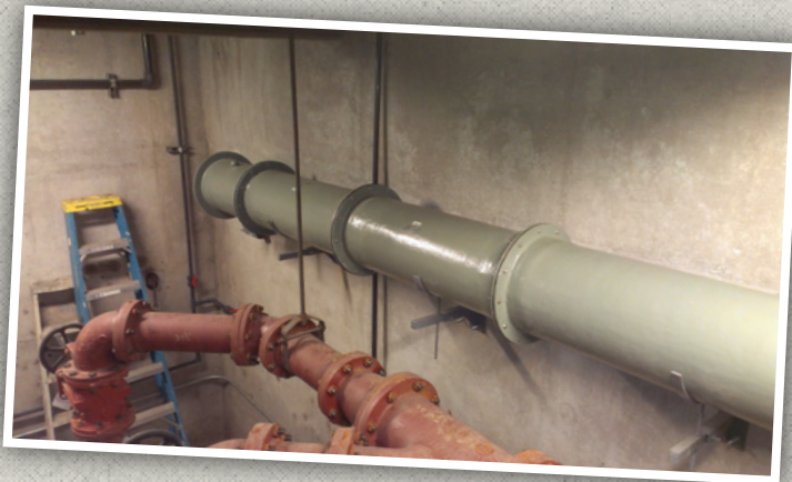
Neville Township Waste Water Treatment Plant

We can fabricate to any custom design. Please contact us with any questions about customized FRP engineering or installation.